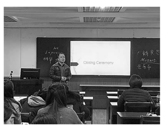
WC2020: Closing Ceremony