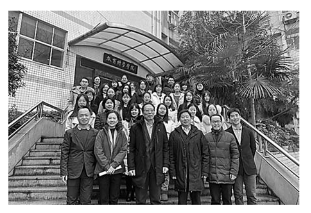
WC2020: Group Picture