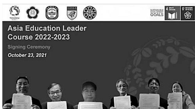
Asia Education Leader Course 2022-2023 Agreement Signing Ceremony

With the end of AELC (2019-2021), we were pleased to start a new round (the fourth round) of AELC (2022-2023). On October 23, 2021, AELC partner universities jointly held AELC2022-2023 Online Agreement Signing Ceremony. About 32 faculty members and students joined the ceremony. We reviewed our AELC journey (2014-2021) in the ceremony by a short video. Many photos and videos were provided by students and scholars of AEL partner universities. Also, we received individual messages from 13 AELC students and alumni at AELC partner universities to share their experiences and reflection about AELC.