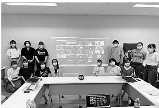
AEL 2022 Summer Course: A-P course