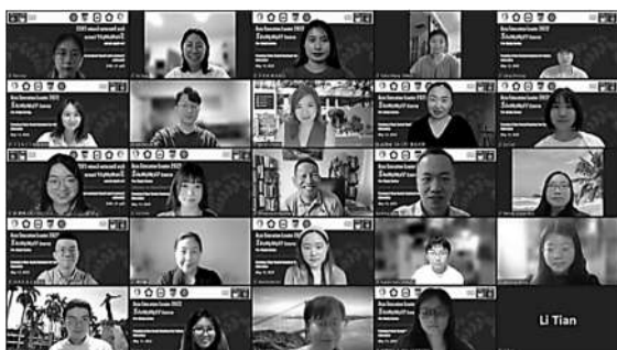
AEL 2022 Summer Course Pre-study Session

The summer course in 2023 will be held by Korea University.