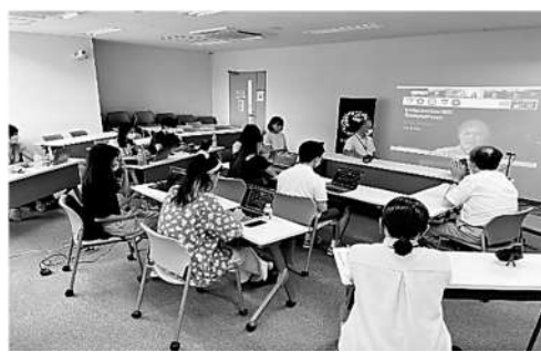
AEL 2022 Summer Course: Opening Ceremony