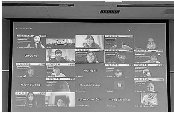
AEL 2022 Summer Course: S-P course