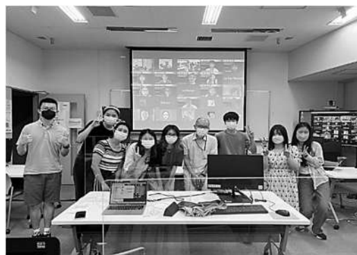
AEL 2022 Summer Course: K-P course