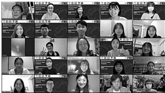
AEL 2023 Winter Course Pre-study Session