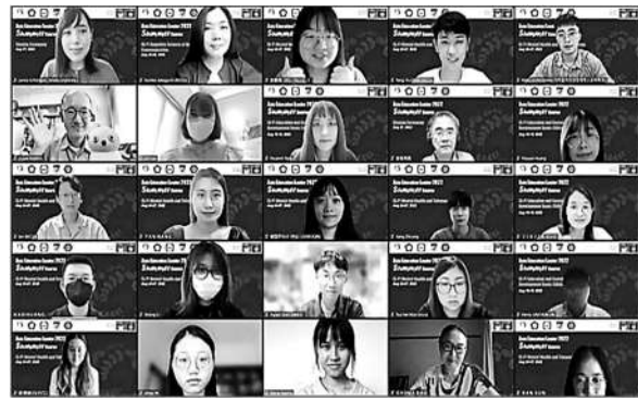
AEL 2022 Summer Course: Closing Ceremony