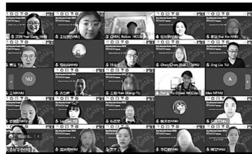
AEL 2023 Winter Course