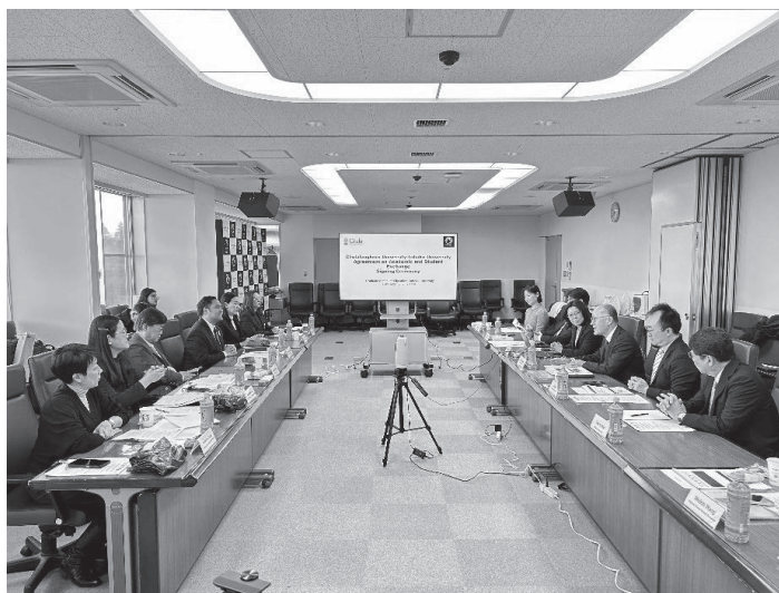
Asia Education Leader Course (AELC) Coordinator Meeting 2026

As mentioned above, the Winter Course 2026 (WC2026) was hosted jointly by National Taiwan Normal University (NTNU) and National Chengchi University (NCCU) from February 2-11, 2026 and held at Tohoku University in Sendai Japan. Three subjects were offered (Table 5) and 63 participants from seven partner institutions took part in the course (Table 6).