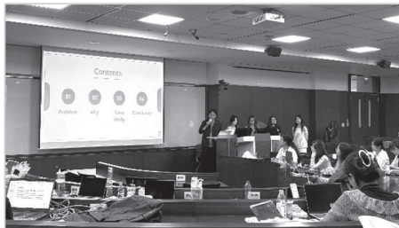
AEL 2025 Summer Course: S-P course