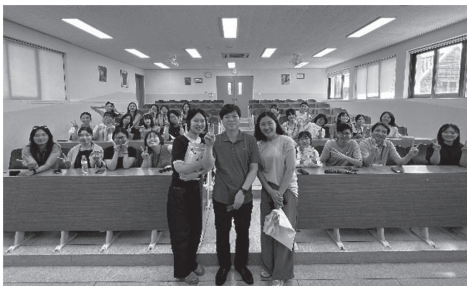
AEL 2025 Summer Course: K-P course