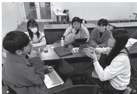
AEL 2026 Winter Course: S-P course