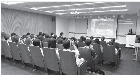
AEL 2025 Summer Course: Opening Ceremony