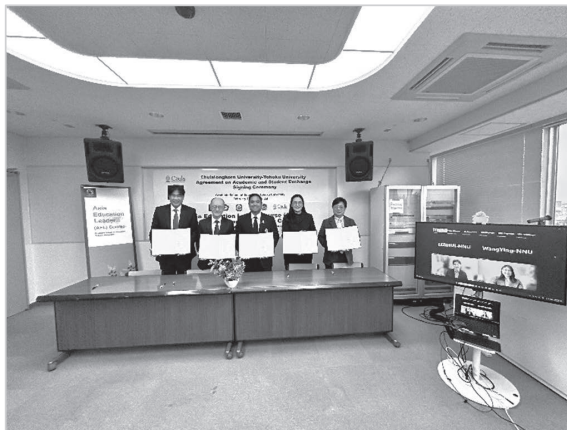
Asia Education Leader Course (AELC) 2026-2027 Agreement Signing Ceremony