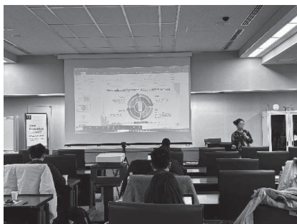
AEL 2026 Winter Course: K-P course