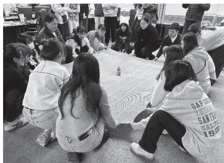
AEL 2026 Winter Course: A-P course