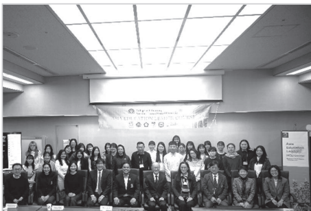
AEL 2026 Winter Course: Opening Ceremony