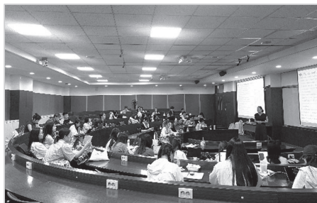
AEL 2025 Summer Course: A-P course