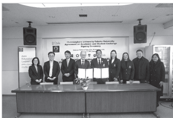
Chulalongkorn University-Tohoku University Agreement on Academic and Student Exchange Signing Ceremony

With the conclusion of the fifth round of AELC (2024-2025), we were pleased to host the Asia Education Leader Course (AELC) 2026-2027 Agreement Signing Ceremony to initiate a sixth round of AELC (2026-2027). On February 1, 2026, representatives from each AELC partner institution convened to sign the agreement and celebrate a new phase of collaboration. In addition to Tohoku University, National Chengchi University, Nanjing Normal University, Korea University, and National Taiwan Normal University, the ceremony was also attended by the newest AELC partner, the Chulalongkorn University Faculty of Education. Prior to the Agreement Signing Ceremony, the Chulalongkorn University-Tohoku University Agreement on Academic and Student Exchange Signing Ceremony was held to officially establish the partnership with Chulalongkorn University. Following both signing ceremonies, an AELC Coordinator Meeting was held to reflect on the merits and challenges of AELC and discuss plans for the future of the program.